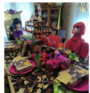
Charlie & the Chocolate Factory Display in the Dining Room